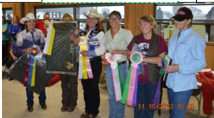
Non Pro Division