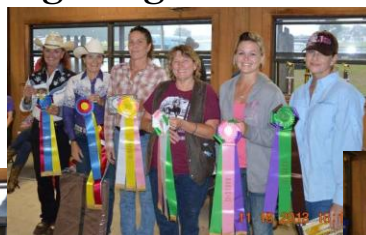
Non Pro Division