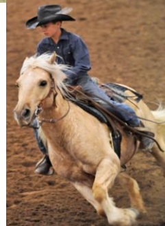
Cullen & Tater

We need more Member Spotlight Bios.....Please email your information and pictures to southernobstaclechallenges@gmail.com