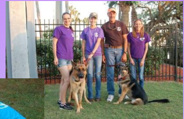
Daytona Beach German Shepherd Rescue