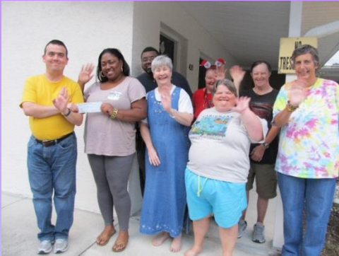
The Key Center