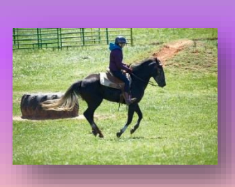
Casey Hiser Extreme Cowboy Races