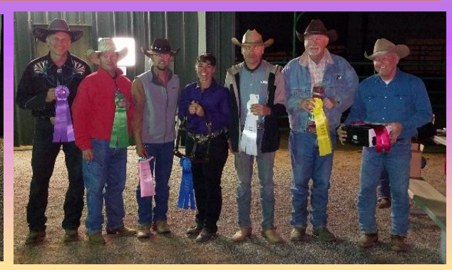
Novice Non Pro Green Horse