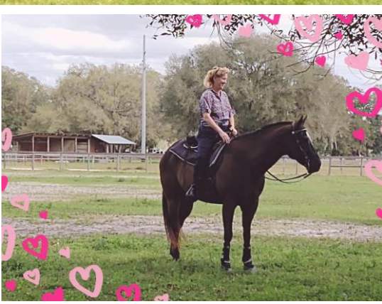
Southern Obstacle Challenge Association P.O. Box 1479, Bushnell, FL 33513