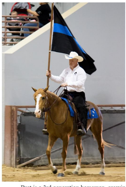
Flying L Stable located in Mount Dora Florida is featured in our new Sponsor Spotlight this month.