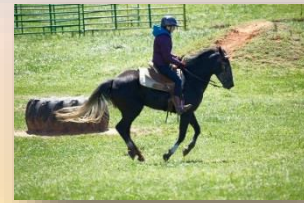
Casey Hiser Extreme Cowboy Races