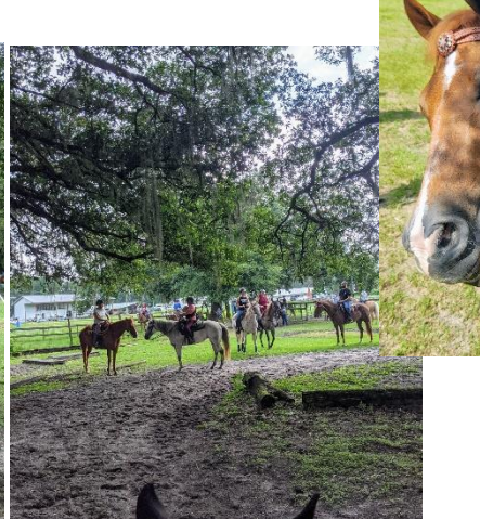
Southern Obstacle Challenge Association P.O. Box 1479, Bushnell, FL 33513