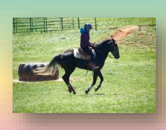
Casey Hiser Extreme Cowboy Races